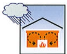
Contains internal heat in winter